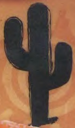
El Charro Fajitas